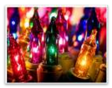
CHRISTMAS ADVENTURES Sat, 19 Dec