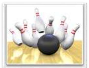
DREAMWORLD FRIGHT NIGHT Sat, 17 Oct