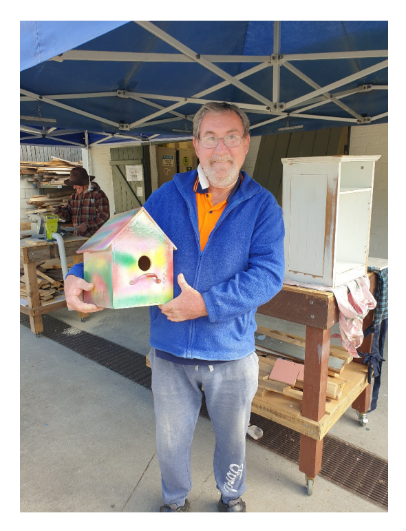
Left: Programs at Luke's Place Salisbury Road during the year included Woodwork and Hobbyists workshops.

• The Ten Pin Bowling Group continued play weekly on a Saturday. The group are part of a league at Richlands called Bowling All Stars. The group is committed to their league and as part of their