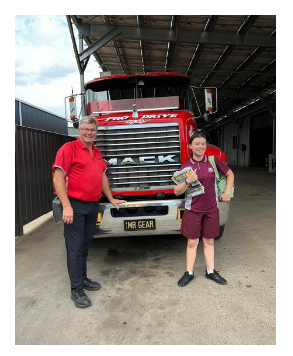
Our Teenage Group checking out the trucks at Pro Drive.

seeking funded or sponsored opportunities for staff to acquire formal qualifications relevant to their role.