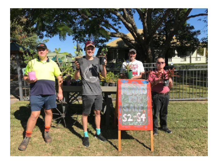
Our Gardening Group having a plant sale at Luke's Place Salisbury Road.

The website complies with Web Content Accessibility Guidelines 2.0 (WCAG) which is the world standard for accessibility and includes a