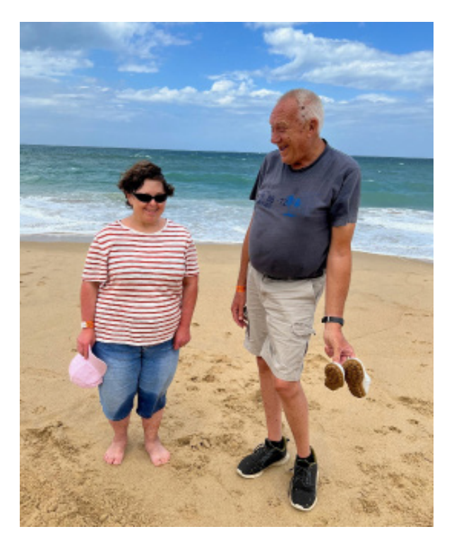
Enjoying the summer with a day out at the beach.

• Tuesday's clients attend The Lockyer Woodcrafters Group where they learn the skill of woodturning. Staff and clients also work on items that can be