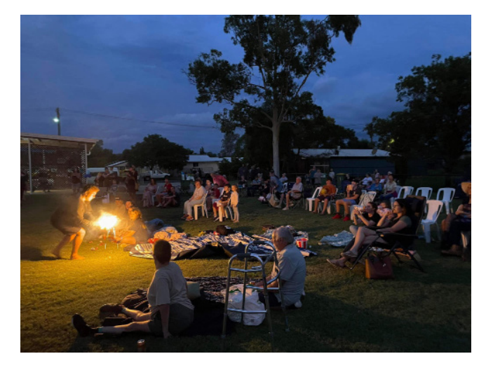
ALARA Lockyer's Movie Night Under The Stars in March 2023.

ALARA's business model relies heavily on its IT infrastructure and ALARA's overall investment in this space has allowed us to focus on areas such as "secure productivity" – ensuring that our systems and data are secure while still providing access to the information and applications required by all stakeholders as required and approved, whether internal or 3rd party- as well as delivering other important enhancements such as electronic document signing capabilities, ongoing improvements to our data handling and data governance capabilities and increased collaboration through the finalisation of our Modern Workplace