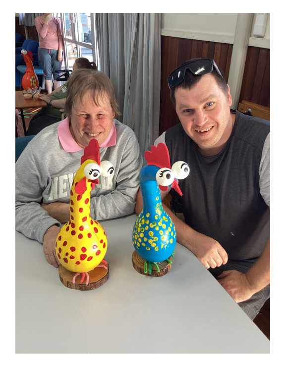
Left: Programs at Luke's Place Salisbury Road during the year included Woodwork and Hobbyists workshops.

• The Give a Cook a Break is a late afternoon activity, with participants preparing a meal and dessert or single course for their family on a Friday afternoon. Groups operate at both Warwick Road and Salisbury