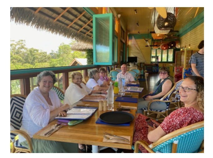
Enjoying time together with friends at the Sunshine Coast.

short-term counselling is available in the event of a critical Incident.