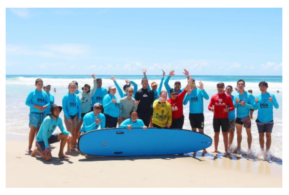
Let's Go Surfing Group with the Disabled Surfers Association Gold Coast.