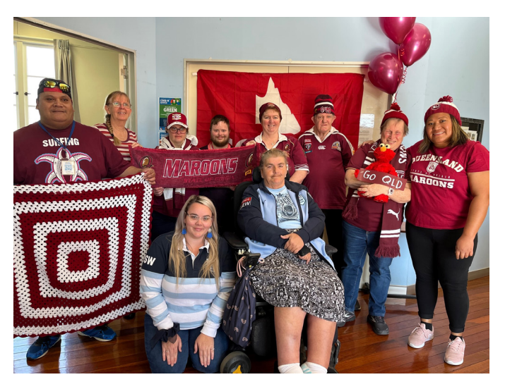
Luke's Place Warwick Road celebrating State of Origin.