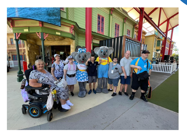
Our Social Group having a great time at Dreamworld.

Clients participate in a weekly carwash. All monies raised go to support the Community Garden established by ALARA which is located at the